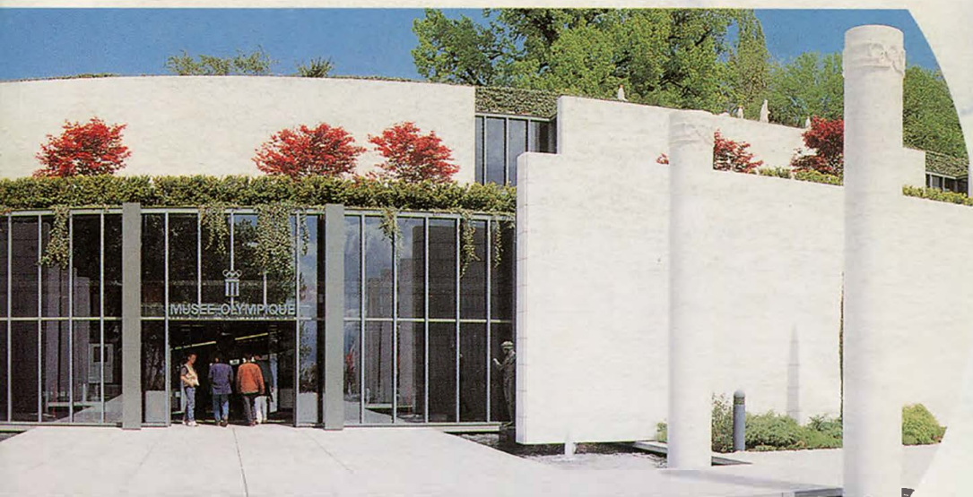
The Olympic Museum in Lausanne